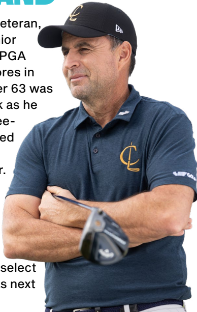
Senior Major Champion