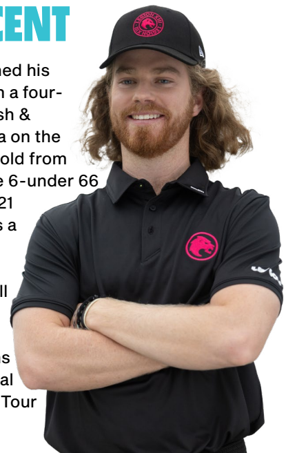
Sunshine Tour Win